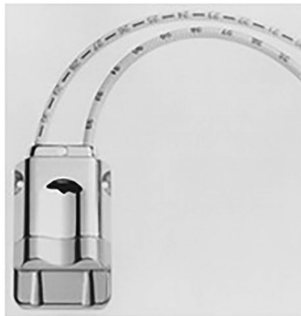
FIGURE 2: Dialock system. Adapted from Levin and Ronco [15].

The pressure drop between the patient vessel and the access pressure detecting point in the extracorporeal circuit is due almost entirely to the catheter.