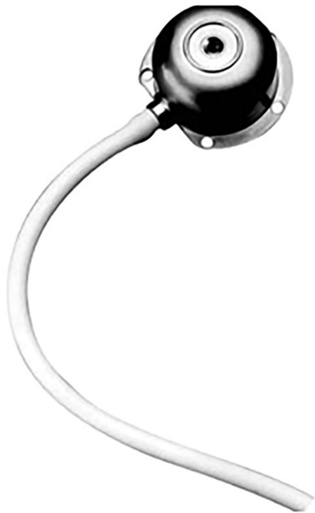
FIGURE 1: The LifeSite system. Adapted from Levin and Ronco [15].

Considering that blood viscosity does not vary much (it depends on blood characteristics like haematocrit and protein concentration), the main parameters affecting the pressure drop are the geometric characteristics of the catheter (diameter and length). In particular, the pressure drop is proportional to the fourth power of the diameter. Consequently, it would be desirable to increase the diameter in order to reduce as much as possible the pressure drop and to avoid catheter collapse.