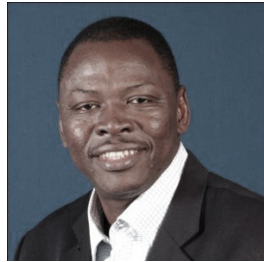
Welcome address of the Regional and Research Program Director ICRISAT- WCA

The Research Program-West and Central Africa is structured around four (4) research themes: 1.) Crop Improvement; 2.) Integrated Crop Management; 3.) Systems Research; and 4.) Policy and Impact. The presentations addressed these four themes, highlighting key achievements and focusing on perspectives and areas of collaboration within and across the three regions (Asia, ESA and WCA) and also with key stakeholders within our mandate areas.