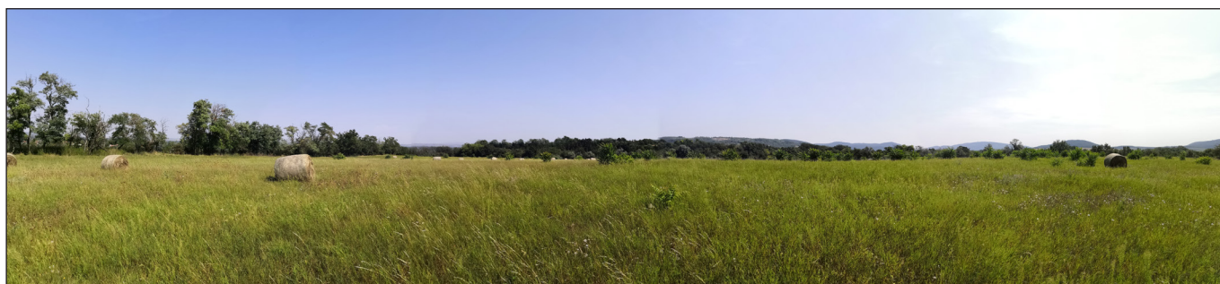
Fig. 1. Panoramic view of the loess plateau of Süttő, with the Gerecse Hills in the background

Traces of past human actions that transformed the natural environment are usually easily recognizable in the landscape, but the early Iron Age monumental landscape features of the Central Danube Basin are often difficult to identify. Realizing this, an international cooperation was launched, which connected 20 institutions from five countries and gained the generous support of the European Union Danube Transnational Programme (Early Iron Age monumental landscapes of the Danube basin, shortly: Iron-Age-Danube project). The project aimed to apply a unified research strategy for the preservation and presentation of the characteristic Iron Age cultural heritage of the area. 1 Since the beginning of the international program, reports on its results have been regularly published in the journal Hungarian Archeology.