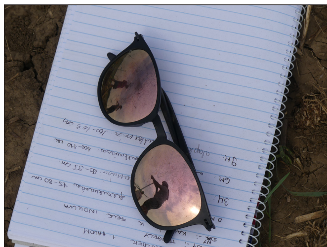
Fig. 2. Drilling for pedological mapping

Besides the progressive idea of creative tourism, the European cultural road network should be mentioned. The terms and conditions for international cooperation established with the support of the Council