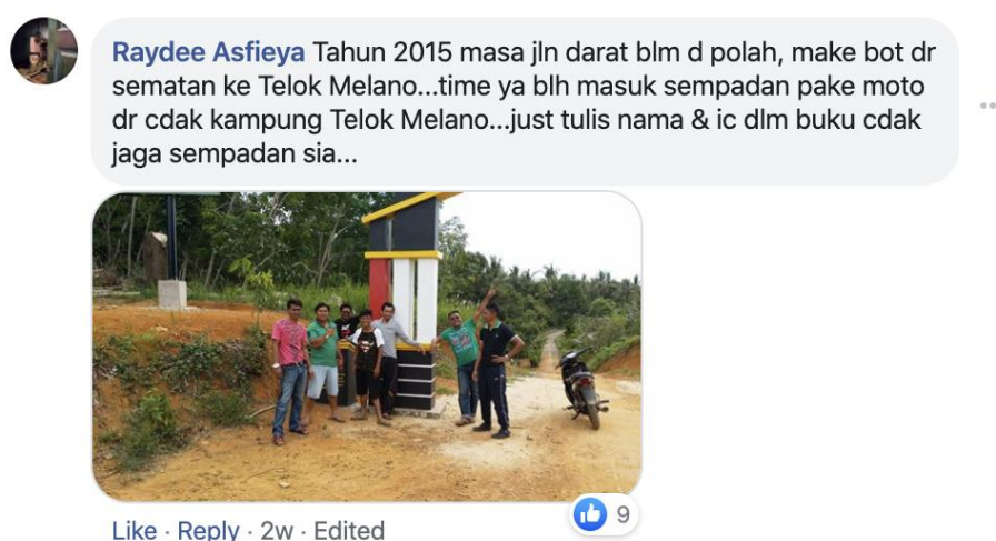
Figure 4: Original screenshot from Facebook public post.

We found that the current narrative on Facebook at least tends to incline towards highlighting the illegal activities due to the loose border control by the authorities. Although the blame tends to be pushed towards Indonesia nationals, some also said local criminal syndicates are also benefitting from the vulnerable Sarawak's border. Results also revealed that most of the conversation related to Sarawak highlighted weak border control allow for villagers living near the border to easily cross by merely writing their names and identification number in a logbook by the border post. Say, for example, an Internet user by the name of Raydee Asfieya said (the original comment was made in Sarawak Malay, refer to Figure X), 'In 2015 when the road has yet to be constructed, we only used the boat to Telok Melano. At that time, we could also use a motorbike from Kampung Telok Melano, write your name and your identification card number in the border post's logbook.'