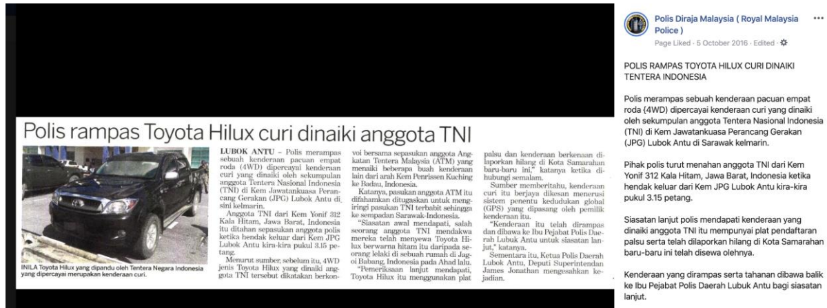
Figure 1: Facebook post shared by Royal Malaysia Police on October 5, 2016 related to the seizure of stolen Toyota Hilux driven by the Indonesian National Army in Lubuk Antu, Sarawak.