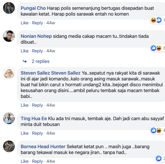
Figure 5: Original screenshot from Facebook comments related to Sarawak-Kalimantan border issues.

Another point that we found from our analysis is the push for reestablishment of the now-defunct Sarawak Rangers and Border Scouts in Sarawak to facilitate authorities in strengthening state borders. For example, one Internet user stated that reviving Sarawak Rangers and Border Scouts should be the top priority of the government as an effort to enhance border control mainly due to the upcoming relocation of Indonesian capital to East Kalimantan (see Figure 2).