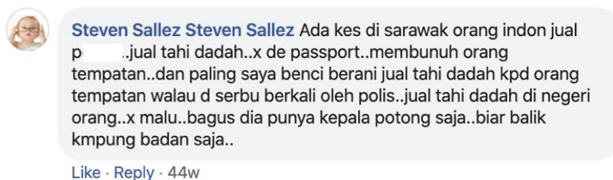
Figure 3: Example of one of the comments in Malay left by a Facebook user, Steven Sallez Steven Sallez. Censored word is referring to female genitalia in the local dialect.

The inclination to blame local authorities could be seen through the comments left on content related to Sarawak-Kalimantan borders. Other transnational illegal activities highlighted by Internet users also include transnational drug syndicate, illegal crossings, the kidnapping of local people, and auto thefts.