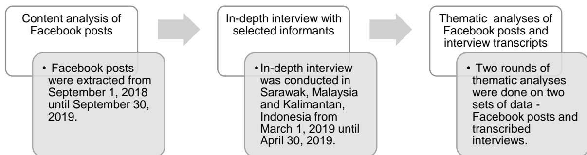
Figure 2: Data collection and analytic process

Data obtained from Facebook and in-depth interviews later analyzed using thematic analysis. Thematic analysis is a technique to examine data in identifying the themes (or patterns) within qualitative data (Clarke & Braun, 2013). Thematic analysis is a flexible method to identify themes or patterns of a language because of its applicability within a range of theoretical frameworks (Aronso, 1995). It is not tied to or require any specific theory of language or explanatory framework for it to work. Thematic analysis is a useful analysis method in a data-driven analysis that is meant to understand the representation of phenomena (Lindlof & Taylor, 2017). Thematic analysis for this study was done in two stages, the first stage focusing on the content retrieved from Facebook and followed by the second stage, analysis of transcribed transcripts from the in-depth interview sessions.