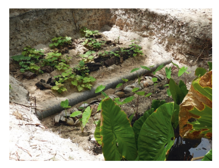
Fig. 9.2 Terraced pits with "rooms" for different crops such as giant swamp taro, sweet potato, and taro

water was pumped to an overhead water tank, providing a consistent source of gravity-fed water for irrigation. Soil water meters were also installed to gauge how much water should be applied and detect water distribution in the soil. Using water meters to fine-tune how much water should be applied proved effective in conserving water while ensuring plants received enough to thrive. This tool could be applied on other atolls, where water is generally a limited resource.