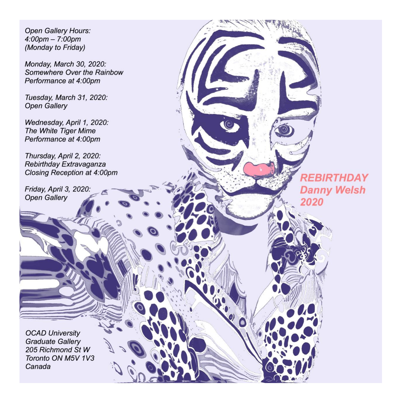
Figure 11: Rebirthday Poster: Danny Welsh, 2020