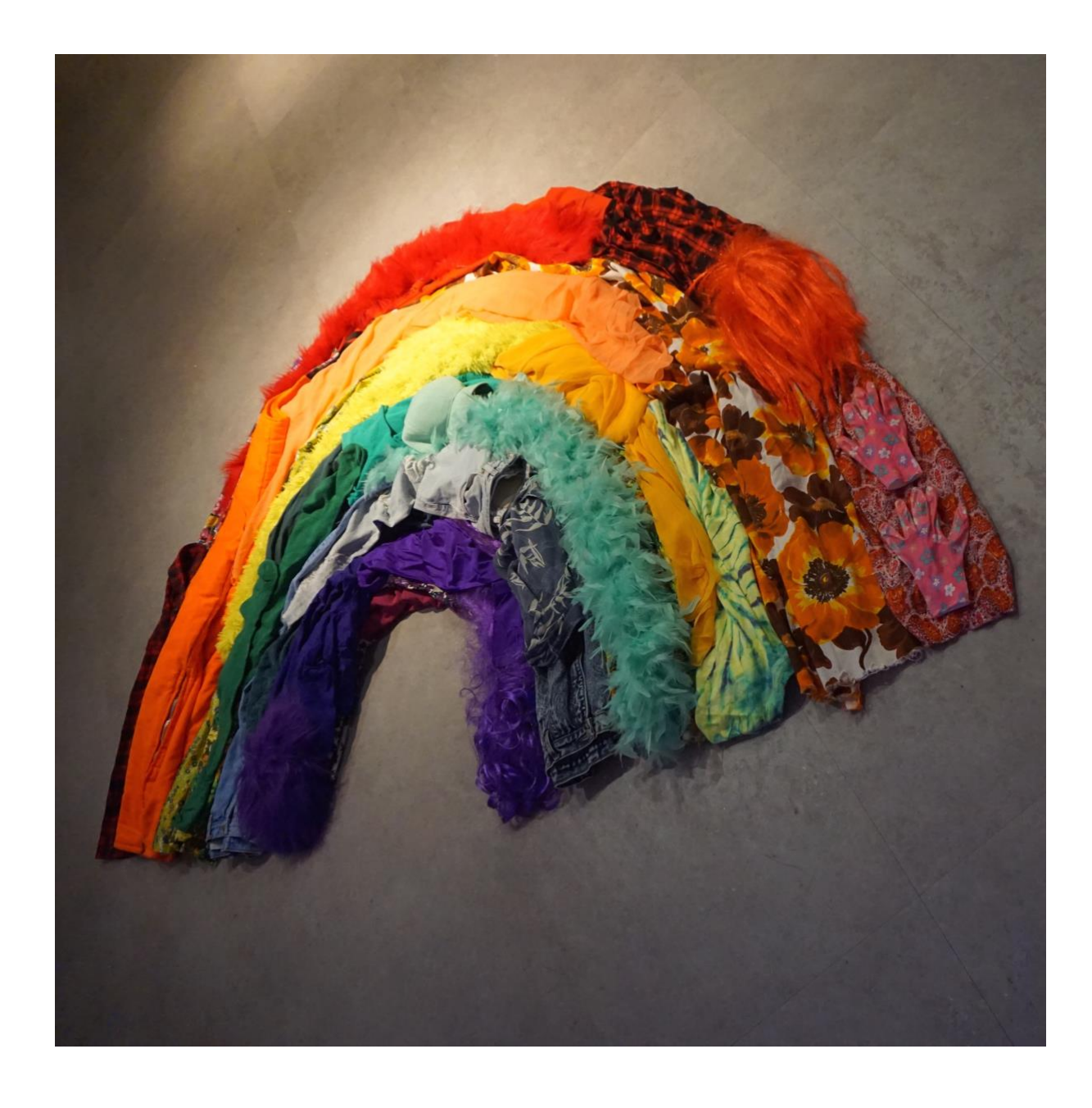
Figure 13: Somewhere Over the Rainbow: Danny Welsh, 2019 Preliminary Installation of Rebirthday: Self-presentation, Suppression and Externally Excessive Expression, 14 November 2019 (Rm 418, 205 Richmond Street West, Toronto).