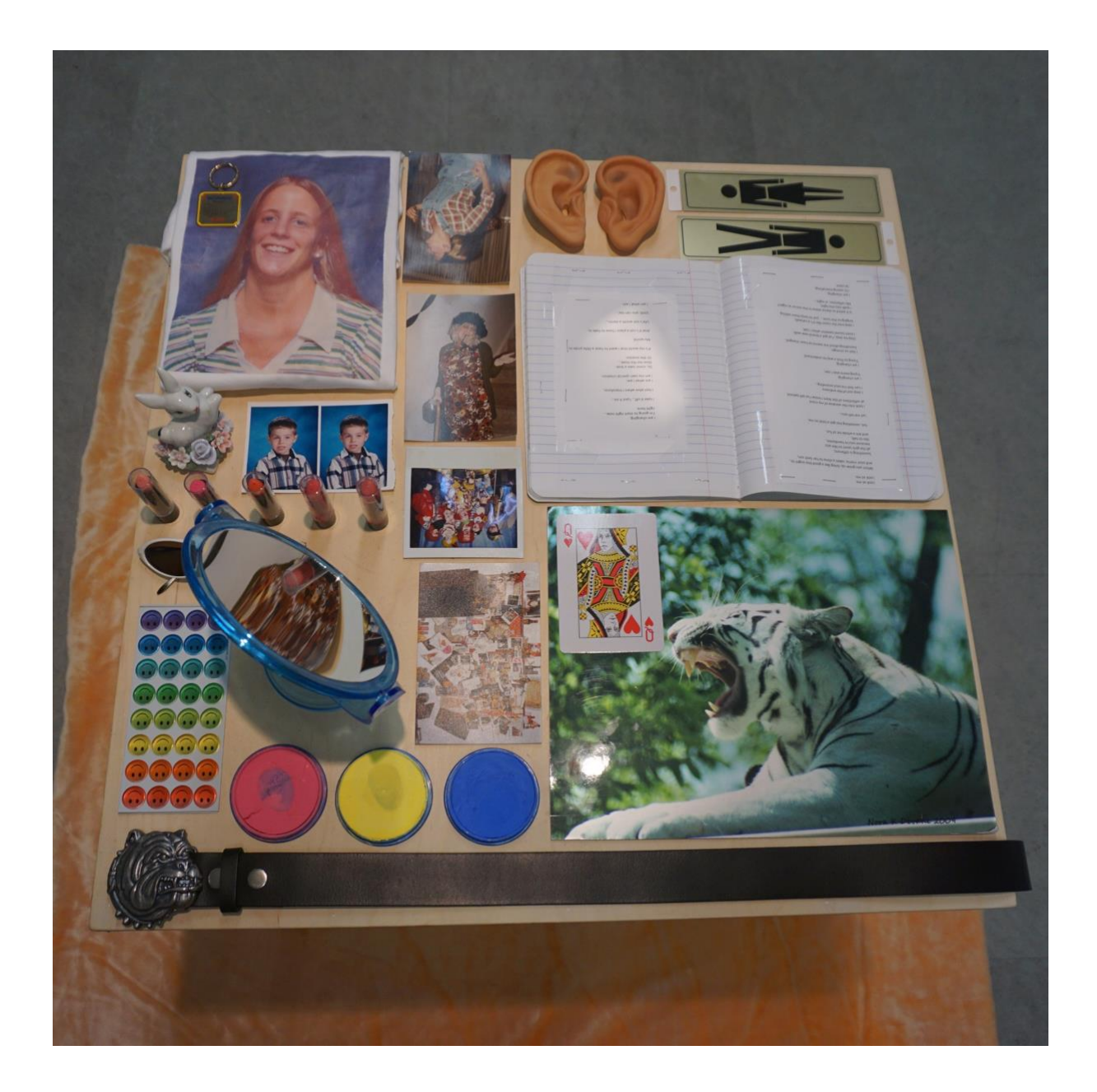
Figure 10: Table of Contents: Danny Welsh, 2019

Through the assemblage of these materials, my sculptures demonstrate the subversion of iconography. My desire to create body-centric sculpture and performances through the customization and assemblage of found objects engages with ideas of masking, mutation and self -making. When pondering perceptions of what makes an object itself, I acknowledge the mutual interaction between the object and the place of the object within human life as being profoundly relational.