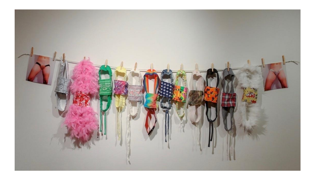
Figure 8: TUCK: Danny Welsh, 2018