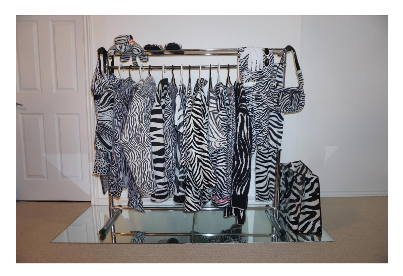
Figure 14: The White Tiger Mime: Danny Welsh, 2020

A costume rack of clothing items and accessories are seen beside the vanity. The costume rack and vanity is accompanied by a one-person mirror and platform that acts as a stage. My installation is evocative of an imaginary change room. I subvert the conventional black and white stripped attire of the modern mime by creating a costume rack entirely comprised of clothing patterned with the markings of the white Bengal tiger.