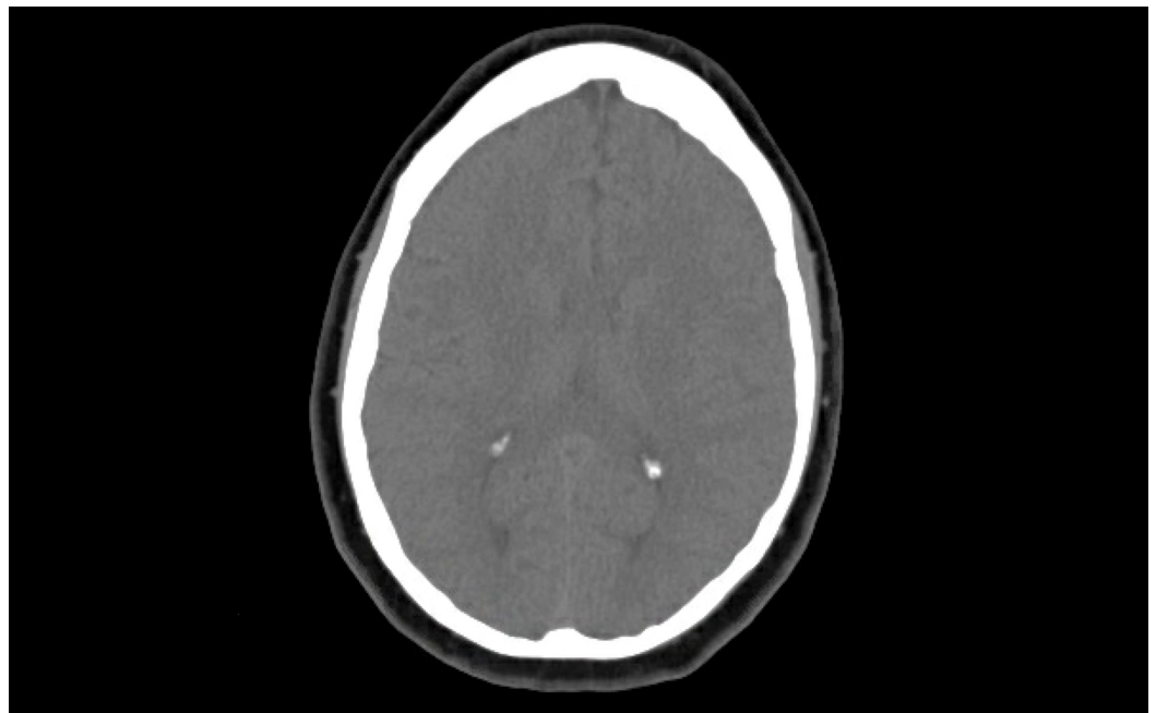
FIGURE 1: CT head without contrast

In the ED, her initial vital signs were: temperature 98.1°F, blood pressure 142/81 mmHg, respiratory rate 18 breaths per minute, heart rate 84 beats per minute, and oxygen saturation 95% on ambient air. Physical examination was completely unremarkable. The only abnormal laboratory results were: erythrocyte sedimentation rate (ESR) 31 mm/hr, alanine transaminase (ALT) 31 U/L. Computed tomography (CT) head without contrast showed no acute intracranial abnormality (Figure 1). Her headache was thought to be related to trigeminal neuralgia and was prescribed Gabapentin 300 mg twice a day. There were also concerns for possible COVID-19 infection due to anosmia and ageusia but additional testing was deferred due to the lack of fever, respiratory distress, and laboratory abnormalities. This decision was made upon extensive discussion with the infectious disease specialist, as the clinical suspicion for COVID-19 was extremely low because it could be related to her seasonal allergies. The patient remained stable overnight.