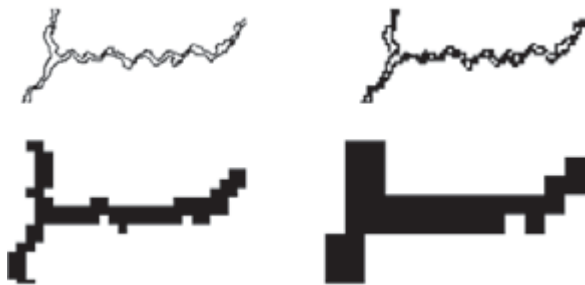
Figure 1. Initial steps of the binary image of the cranial suture superimposed with the tiles of the increasing edge.

The value of fractal dimension is interpreted as follows. The whole number portion (the digit to the left of the decimal place) depicts the dimension of an object, while the decimal portion (the digit to the right of the decimal place) represents the level of complexity of the object. For example, if the fractal dimension equals 1.2, then 1 indicates the linear feature of an object, while 2 expresses the level of structural complexity related to the curvatures of the line. Greater values of a fractal dimension indicate a more complex structure while lower values denote a decrease in structural complexity. The range between minimum and maximum, standard deviation and the variance expressed the variability of the frac-