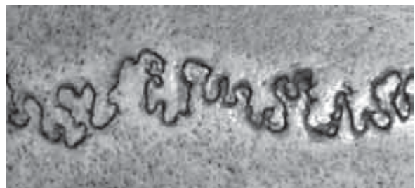
Figure 3. A segment of complicated, meandric interparietal suture, DF = 1.41.