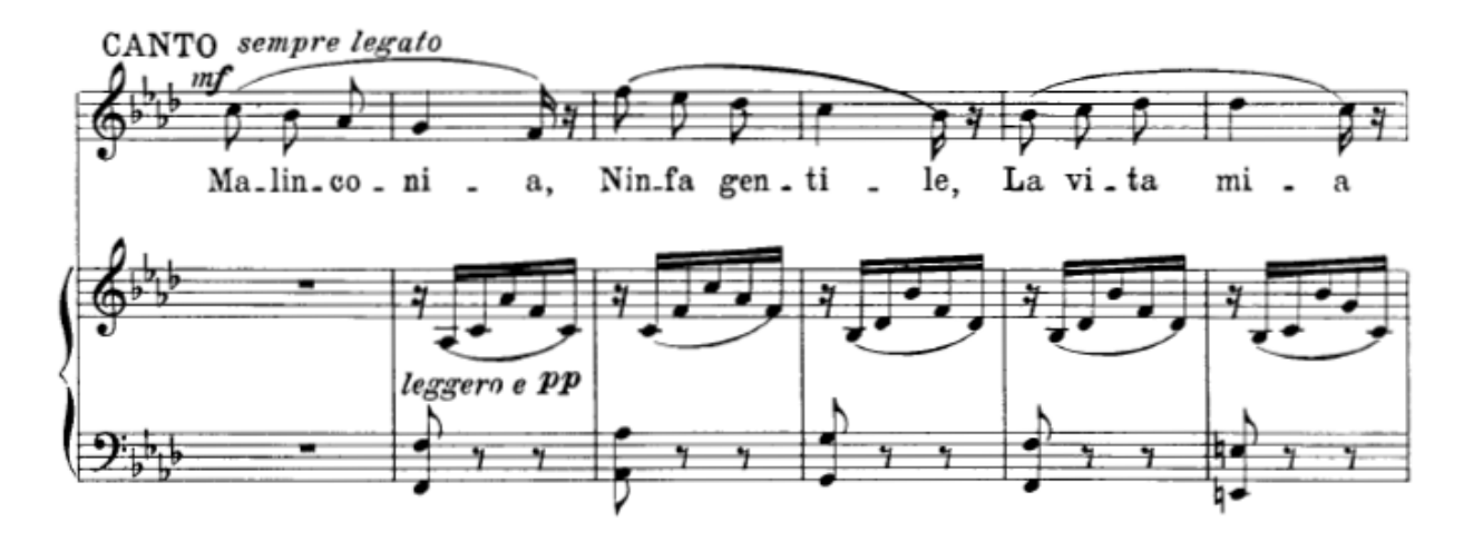
Example 4.1 Bellini's "Malinconia, Ninfa gentile," Sei Ariette, mm. 11–16<sup>7</sup>