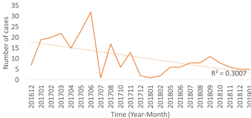
Fig 1. Line graph showing monthly Middle East respiratory syndrome coronavirus cases from December 2016 to January 2019.

Figure 2 shows boxplot of time to specified events for lapsed time from onset of symptoms to hospitalization, onset of symptoms to diagnosis, and onset to death. The case fatality rate was 29.3% in general, and there was a significant difference in the case fatality rates between HCWs (16%) and others (34%) ( P = .001). The presence of comorbidities was 71% among non-HCWs and 1.9% among HCWs ( P < .0001). In addition, the mean age ± SD was 47.65 ± 16.28 for HCWs versus 54.23 ± 17.34 for non-HCWs ( P = .001).