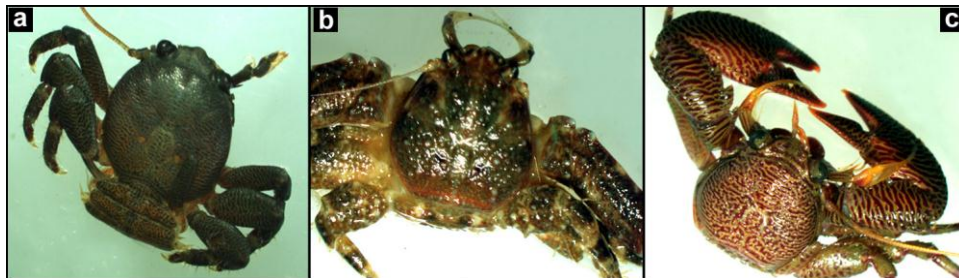
Fig. 1. Some Porcelain crabs (Crustacea: Decapoda: Anomura): a, Petrolisthes rufescens ; b, P. ornatus ; c, P. boscii (collected from the coastal waters of Pakistan).

A molecular technique allozyme electrophoresis is a powerful technique to study genetic variation (Ward and Grewe 1995), intra-specific population studies (Sodsuk 1996, Sodsuk and Sodsuk 1998a 1998b, Sodsuk et al. 2001) and also used in invertebrate systematics of swimming crab species includes; Callinectes sapidus (Weber et al. 2003), species of Scylla (Keenan et al. 1998); Chionoecetes bairdi and C. opilio (Merkouris and Seeb 1997), marine invertebrates (Thrope et al. 2000) and some walking crabs like; Sesarma and Uca species complex (Felder and Staton 1994). Recently; some studies was conducted on isozyme variation in different species of crabs from the coastal waters of Pakistan. Odhano et al. (2018) describe the isozyme variations in three populations of Austruca sindensis (Alcock 1900), Naz et al. (2017) studied the isozyme variation in genus Thalamita of family Portunidae whereas, Saher et al. (2016) describe the variation in Carbonic Anhydrase (Ca) isozyme in muscles of five species of Portunid crabs. However, there is no information available on the genetic isozyme variations for the porcelain crabs. The current study aimed and initiated to estimate the genetic variations of morphologically identical species of Porcellanids through isozyme study in order to reveal the isozyme variations and interspecific genetic diversity among the three species of Porcellanid crabs with providence of basic genetic data for further studies.