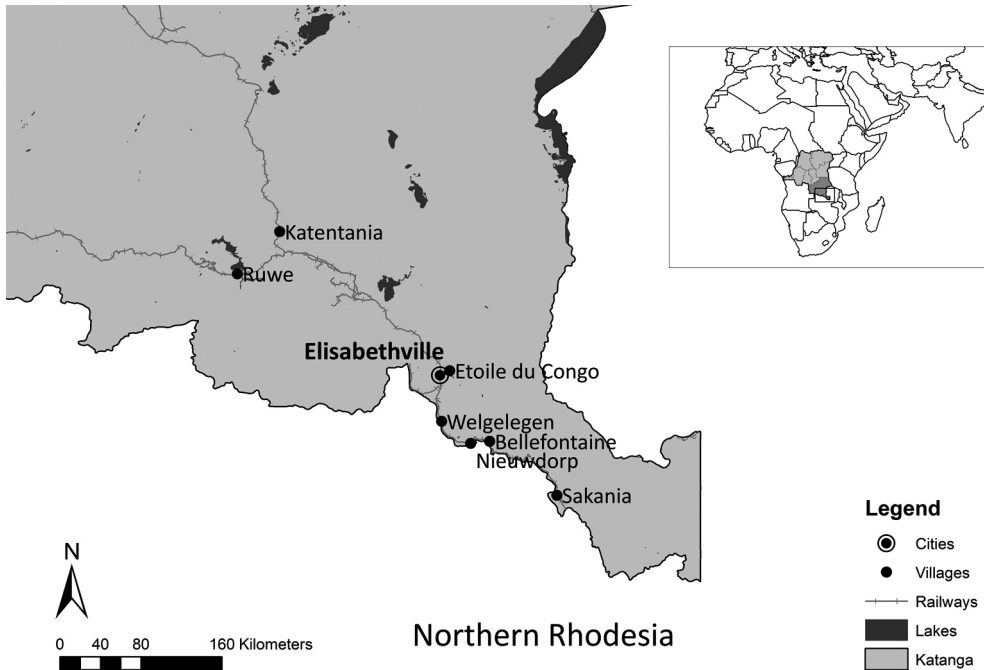
MAP 1 Southeast Katanga (c. 1920)

able to control the immense Congolese territory. Other concerns included the peripheral location and the poor transport connection from Katanga to other Congolese regions (Vantemsche, 2007). All transport to and from Katanga from 1910 was via railways which were in the hands of British investors and ran across Rhodesian and South African territory. Quick and direct railway connections with the Congolese port of Matadi, located on the Atlantic Ocean, and with the African Great Lakes region in the east, only came into being after the First World War. In 1925, Katanga was connected via Bukama to Port-Franqui in the province of Kasai, from where Leopoldstad (now Kinshasa) was easy to reach by boat (Robert, 1950).