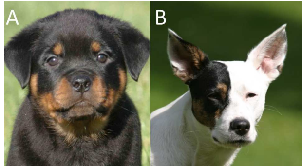
Fig 1. Dog pictures rated by dog's owners. a) Rottweiler puppy, b) Adult mixed-breed dog.