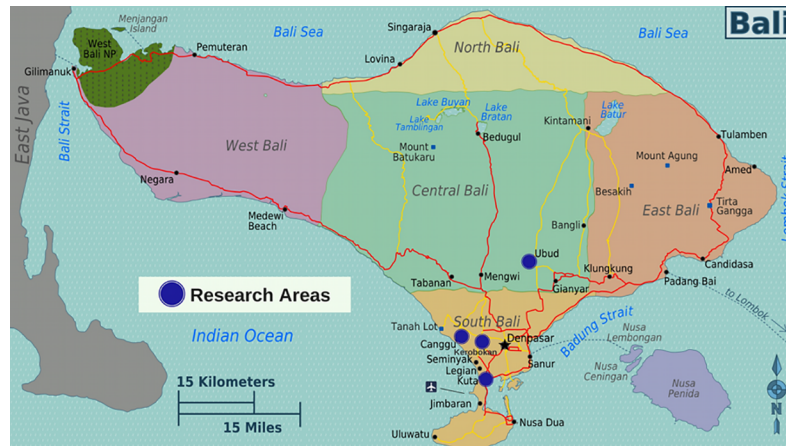
Fig 2. Map of Bali and research areas (Authors: Burmesedays, Peter Fitzgerald, Marco Adda [CC BY-SA 4.0–3.0–2.5–2.0–1.0]).

https://doi.org/10.1371/journal.pone.0197354.g002