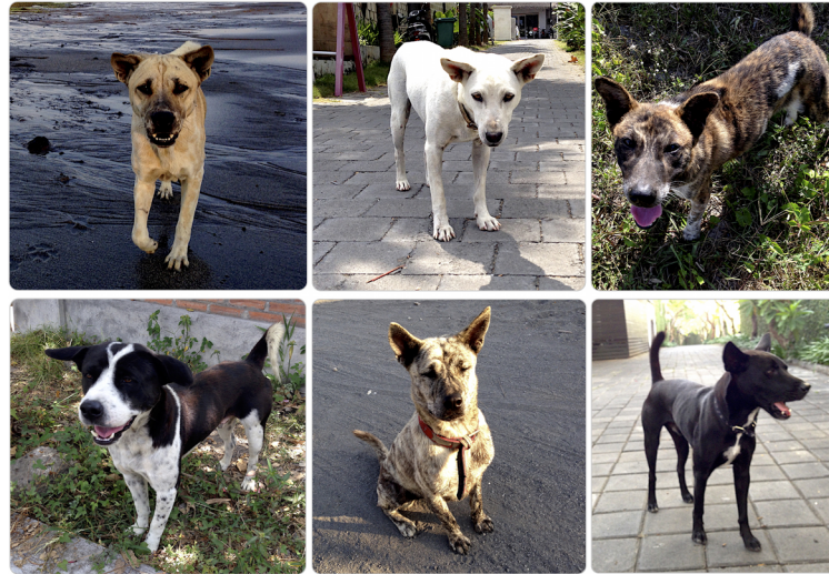
Fig 1. Bali dogs.

https://doi.org/10.1371/journal.pone.0197354.g001