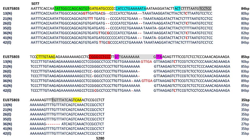
Figure 3. Sequence analysis of the MCPyV NCCR recovered from plasma. The alignment is shown between the nucleotide sequence from 5077 to 5280 of the published sequence of MCPyV in GenBank (NCBI) (EU375803) [2] and that obtained from the sequencing of plasma positive for MCPyV NCCR ( MCPyV 13,21,26,35,36,41,42). ▲ AP-1: 5104–5114 nucleotide position (5'-GATGATGCCCC-3'); 5164–5172 nucleotide position (5'-CTTTGTAAG-3'); 5257–5265 nucleotide position (5'-GTTTATCAG-3'); 5261–5269 nucleotide position (5'-ATCAGTCAA-3'); ▲ NF1: 5088–5105 nucleotide position (5'-TATTGGCCAGCAGTGTG-3'); ▲ TST1: 5200–5214 nucleotide position (5'-GTTGAAAAAAGTTA-3'); ▲ OCT1: 5116–5129 nucleotide position (5'-CATCCTGAAAAATA-3'); 5143–5146 nucleotide position (5'-ACTCTTTTAATG-3'); ▲ NFκB: 5188–5197 nucleotide position (5'-CGGGCCTCCC-3'); ▲ TATA-like sequences: 5146–5160 nucleotide position (5'-CTTTTAATGTCCTCC-3'); 5202–5212 nucleotide position (5'-TGAAAAAAG-3'); 5256–5265 nucleotide position (5'-TGTTTATCAG-3'); E: experienced HIV-1-positive patients; N: naïve HIV-1-positive patients.

Nucleotide substitutions are in bold red text. Deletions are indicated by bold and red dashes. The area highlighted in light gray represents overlapping areas within one or more binding sites. The number of base pair (bp) of each sequence is reported on the right of the Figure.