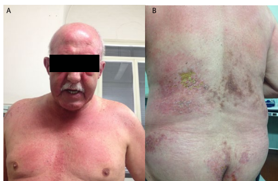
Figure 1: Clinical image Malar and facial dusky erythema associated to massive periorbital edema. Large erythematous lesions on the back, involving also the upper part of gluteus, with a pseudo-necrotic surface, sometimes with a yellowish colour

This observation is important for rheumatologists, dermatologists