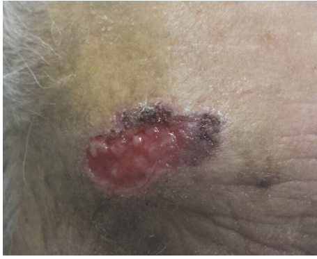
FIGURE 1: Squamous cell carcinoma presenting on forehead in the form of enlarging ulcer.