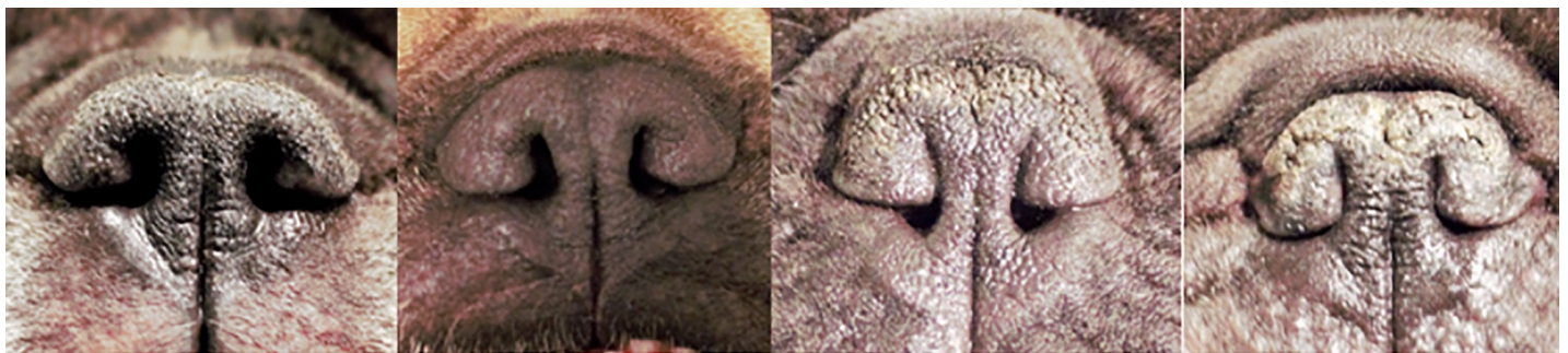
Fig 1. Representative examples of the four NS grades described in Table 1. From left to right: Grade 1, Grade 2, Grade 3, Grade 4.

The BSF score was used as a proxy for degree of BS. This score is a continuous variable calculated on the basis of 16 assessments of upper airway noise and the presence of respiratory distress at rest during and after a submaximal exercise test and after a 15-minute recovery period. Information relating to 1) respiratory distress 2) audible upper airway noise during auscultation of the a) lungs and b) trachea/larynx, 3) the presence of audible upper airway noise without a stethoscope, and 4) decibel recordings was registered prior to and immediately after a 6-minute walk test (6MWT) and after a 15-minute recovery period. The decibel