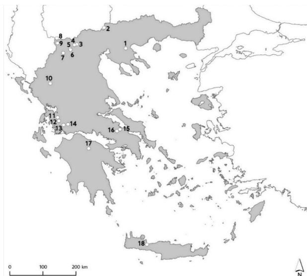
Figure 1. Map of the surveyed Greek freshwater lakes. See Table 1 for lake names.

(Zervas et al. 2018), the most commonly used method for aquatic vegetation surveys in Europe, due to the fact that it provides abundance, frequency and depth distribution data for the different taxa found within the vegetation of a lake (Kolada et al. 2009). Ten to 20 transects per lake were established from the shoreline perpendicular to the maximum depth of plant growth. Sampling was conducted in relevés of 4 m 2 , evenly distributed along the belt transects following a gradient of increasing depth. Sampling was undertaken using a double-headed rake with a scaled handle or attached to a rope, a bathyscope, and a geo-bathymetric device. In this way, a total of 5,690 relevés were sampled, in which all angiosperms (helophytes, hydrophytes, amphiphytes and aquatic forms of land species), pteridophytes, bryophytes, charophytes and green filamentous macroalgae (e.g. Cladophora spp.) were recorded and determined to species or subspecies level (except filamentous macroalgae), and their abundance was estimated with the use of the semi-quantitative five-point DAFOR scale (Palmer et al. 1992). Vascular plant taxonomy follows Euro+Med (2006), while algae taxonomy follows Guiry and Guiry (2019). Chorological information was collected from Dimopoulos et al. (2013, 2016), Guiry and Guiry (2019), and Julve (1998).