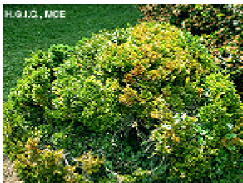
Winter damage on Boxwood

Prevention: Winter damage can be reduced by locating plants in partially shaded areas protected from winter winds. Physical barriers, placed about 18 inches from the plants on the windward side, made from materials such as burlap or plastic, can also lessen winter wind damage by reducing wind velocity. Maintain adequate soil moisture in the fall to prevent winter desiccation. To avoid damage from falling snow and ice do not plant boxwoods under roof eaves. For established boxwoods, tie a string or twine at the base of the plant and spiral the twine up and down the plant to hold it together and gently brush snow off plants as soon as possible. This will help prevent damage from falling ice and snow. Inspect plants for winter damage in the spring and prune out affected areas.