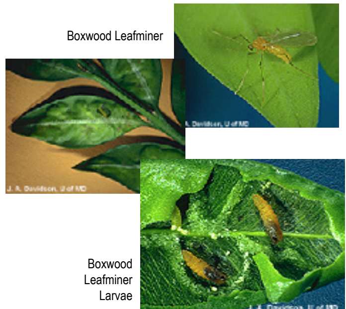
Boxwood Leafminer Larvae