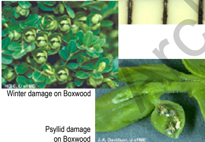
Winter damage on Boxwood

Control: To control boxwood mite, apply a dormant rate of horticultural oil to the undersides of the leaves before new plant growth begins in the spring. Light, summer populations of mites may be controlled with a summer rate of horticultural oil or insecticidal soap sprays. Heavy infestations may require a residual miticide application. A biological control option for heavy mite infestations may be the release of phytoseiid predatory mites that can be purchased from mail order sources. (See Beneficial Insects and Mites, Mimeo HG.6.)