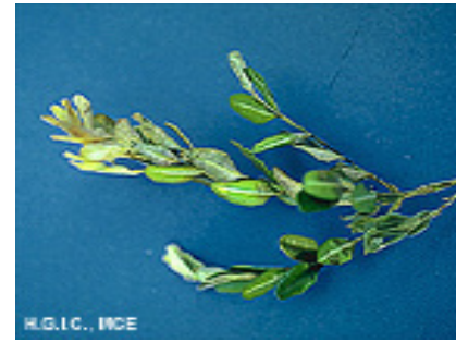
Volutella stem blight

Control: Diseased branches should be pruned out and when the foliage is dry, plants should be thinned to improve air circulation and light penetration. Old fallen leaves and diseased leaves that have accumulated in the crotches of branches in the interior of