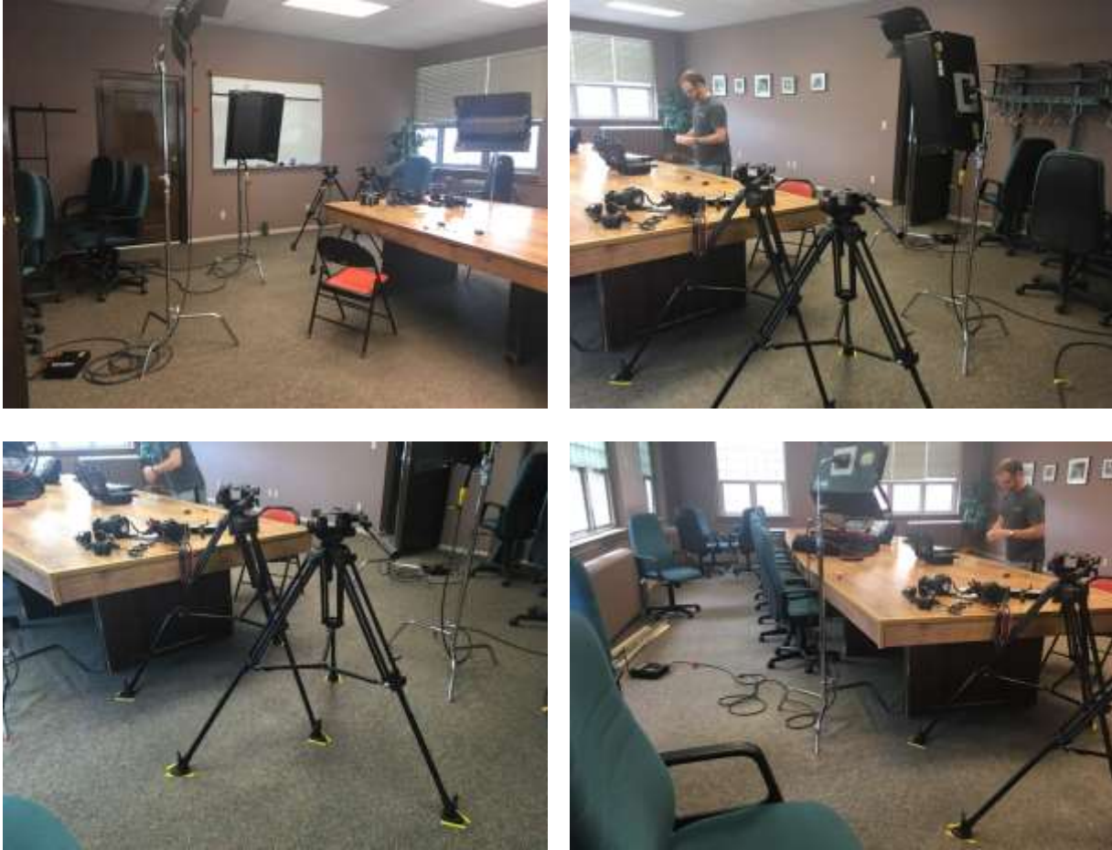
Figures 3.1, 3.2, 3.3, 3.4. Interview setup in conference room. Pictured: Nick Hawthorne.

Employee interviews were filmed just outside of the Dish-ability kitchen, Gym Dandy, with a similar but simplified setup. Only one camera was used, and only practical light was used. Customer interviews were filmed on the sidewalk outside of Slainte, 43 East Park Street, Butte, Montana. Again, only one camera and natural light were used.