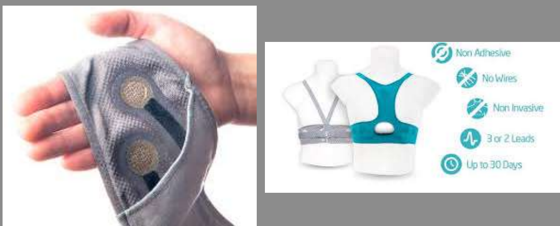
Figure 3 - NUUBO wearable ECG unit