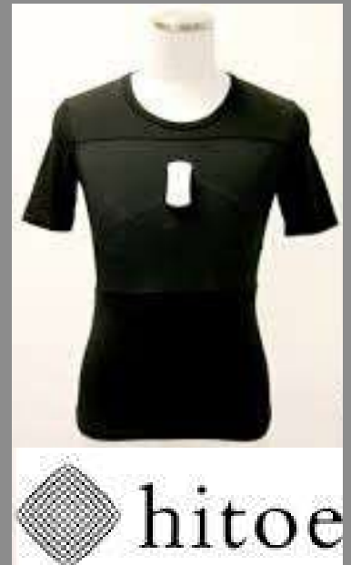
Figure 2 - Hitoe™ bio-electrode conductive nanofiber fabric

Likewise, Nuubo 12 is a wearable medical technology company which offers e-textile technology BlendFix sensor electrodes, for remote ECG monitoring with a cost-effective, simple, transparent and non-intrusive method.