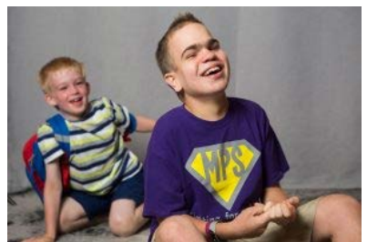
Child with MPS III syndrome.