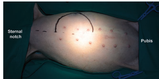
Fig. 1. Preoperative marking: a semi-circular skin paddle is drawn on the upper left side of the abdomen, including the 3 cranial nipples, without crossing the midline to spare the contralateral flap for a second dissection.

At the end of the dissection, the flap was viable. The subcutaneous adipose tissue of the pig is less represented than in human and pigs have an additional muscular layer, the panniculus carnosus, which is the analogue