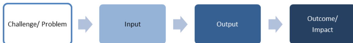
Figure 1. Generic intervention logic (results chain) of the STRIA roadmaps.