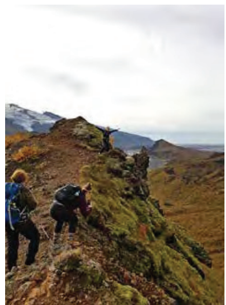
Brugð á leik.