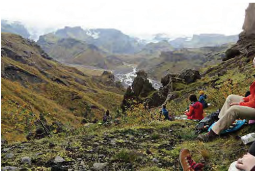
Hádegismatur í náttúruperlunni Þórsörk.