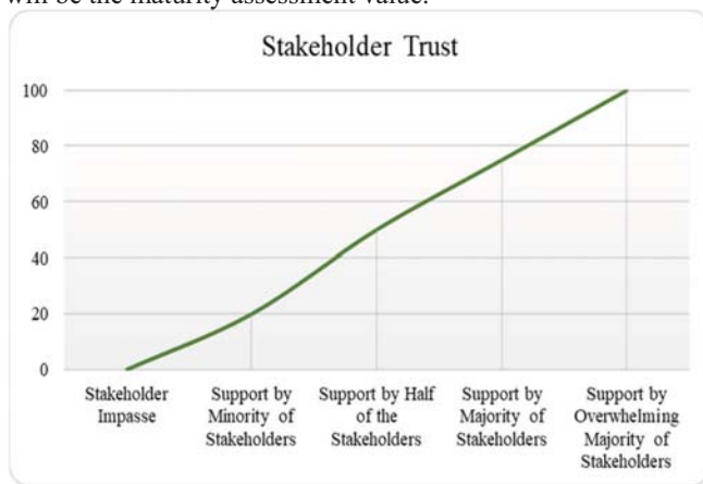
Figure 2: An Example of Desirability Curves

HDM also includes the calculations for disagreement, inconsistency, and sensitivity analysis in order to validate the reliability and robustness of the final model [36], [37], [39]–[42]. Additionally, in instances which there is a need in having a reusable model, or in instances of having many alternatives, desirability curves can be used. The combination of desirability curves with HDM is used to identify levels/ metrics for each criterion. Each level/metric connected to a criterion acts as a useful value to assist decision makers. Using desirability curves approach, the experts need to evaluate related levels/metrics for each criterion (desirability matrix) while giving each metric a scaled quantitative value. This enables the normalization of the evaluation results by experts across all the criteria (Figure 2/Table 2) [40], [41], [43]. In order for the desirability curves to be used, there is a need to identify each criterion's metrics/levels. Following this, the experts are asked to assign quantitative values to each level/metric and the number assigned (the average desirability in case of having more than 1 expert) will be the maturity assessment value.