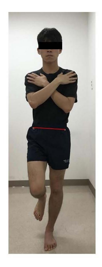
Figure 1. Measurement of lateral pelvic fit.

as the angle between a horizontal line and a line connecting the ASISs (Prior et al., 2014; Figure 1). All photographic images were analysed using ImageJ (ver. 1.44) (Edmondston et al., 2013). The average of three measurements was used for data analysis.