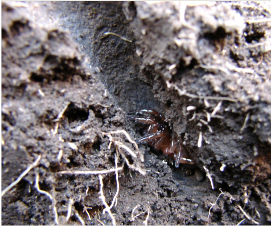
Figure 6. doi