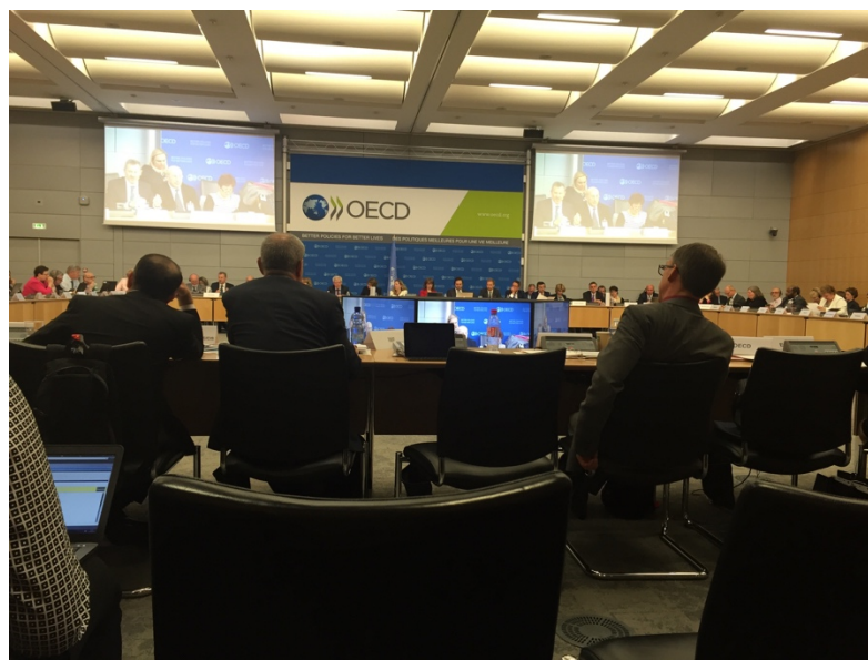
Figure 2: International conference

In this section, we draw on practices that involve presentations and discussions at international meetings we observed (Figure 2). These include, for example, task forces of Eurostat and various meetings of population and housing experts at the UNECE and Conference of European Statisticians. Presentations invariably included a series of repetitions that were not defended as much as put forward as something that everybody knows. We identify four repetitions: defining what Big Data is, how it is better than traditional sources, and what skills it demands; demonstrating how Big Data can or cannot deliver official statistics; differentiating the data scientist from the figure of the iStatistician; and defending the authority of NSIs to establish, and evaluate adherence to, the legitimate criteria for the production official statistics.