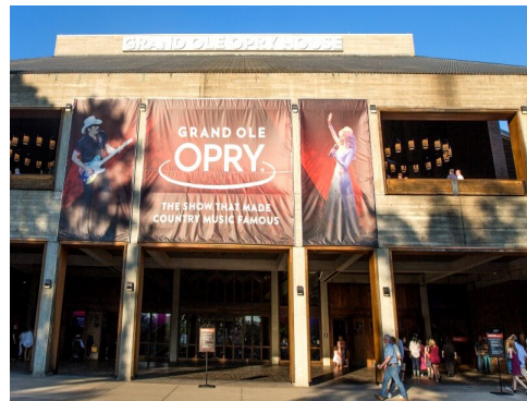
Nashville's Grand Ole Opry

Nashville is renowned for its music-centric attractions and beautiful scenery. The Grand Ole Opry, Country Music Hall of Fame, and the Parthenon are only a handful of its famous attractions. Additionally there are several concert venues, the professional sports teams, and historical landmarks or museums, and downtown life. The majority of residents drive their own vehicles to work. There is a bus system called the