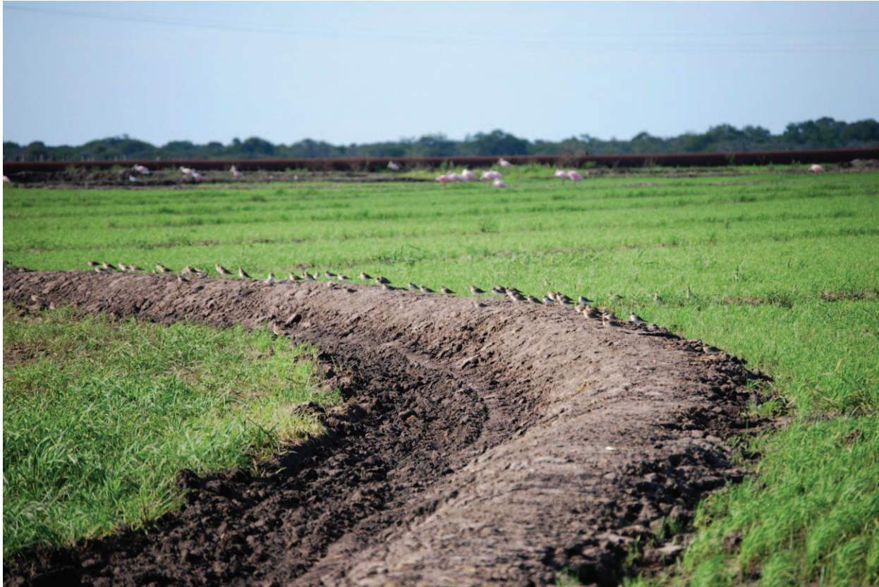
FIGURE 1. Shorebirds, mainly Pectoral Sandpipers ( Calidris melanotos ), resting on a levee in a rice field at Estancia La Lucha, Argentina, January 2010.

products can occur as late as the grain maturation phase depending on pest infestations.