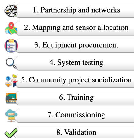
Fig. 1. Methodology of the project implementation

The rest of the paper is structured as follows. Section II presents the design and implementation of our information system. Section III presents the design and implementation of our sustainable plan. Section IV shows the methodology to use. Finally, Section V concludes the paper.