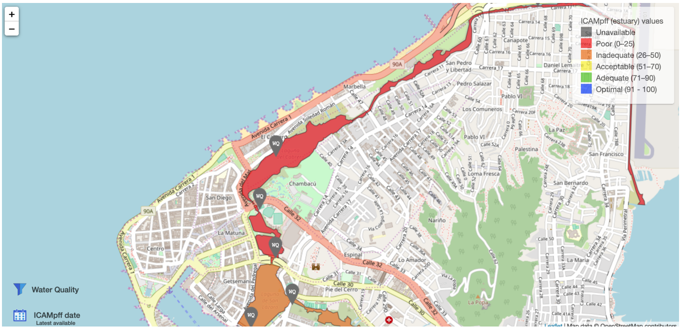
Fig. 2. AquApp user interface.