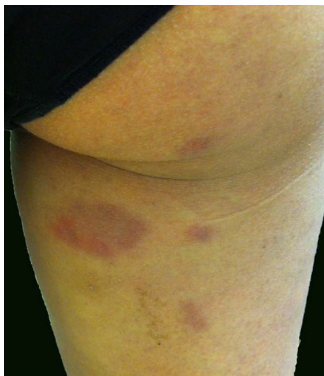
Figure 1 - Erythematous-violaceous plaques on the thighs in a patient with CANDLE syndrome (author's archive).

The most prominent skin manifestations, invariably present in all patients, are annular erythematous or violaceous plaques with an elevated border and a flat centre (Fig. 1), lasting for a few days or weeks and progressing to a residual purpuric macule. Whereas they are almost always present during childhood, they may be less conspicuous after puberty. 2,5 Additionally, during early infancy CANDLE patients present with periorcular erythematous and/or perioral edema and pernio-like lesions on acral sites, which also tend to fade with increasing age. 1,2,5