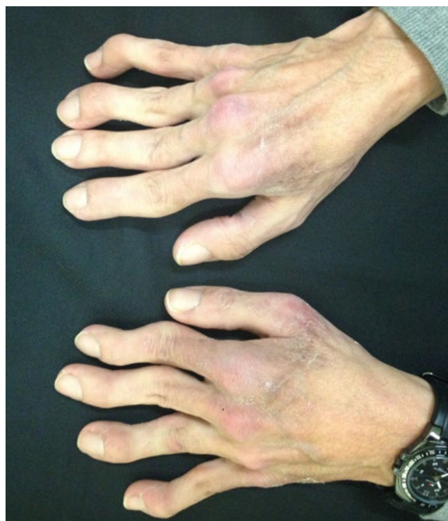
Figure 3 - Joint contractures and muscle atrophy on the hands.

The abdominal fat tissue, on the contrary, tends to be increased, which leads to metabolic disturbances, such as acanthosis nigricans and hirsutism. Hepatosplenomegaly, described in about 65% of CANDLE syndrome patients, further contributes to a protuberant abdomen. 2,5,9