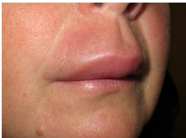
Figure 2 - Lip angioedema in a patient with chronic spontaneous urticaria.