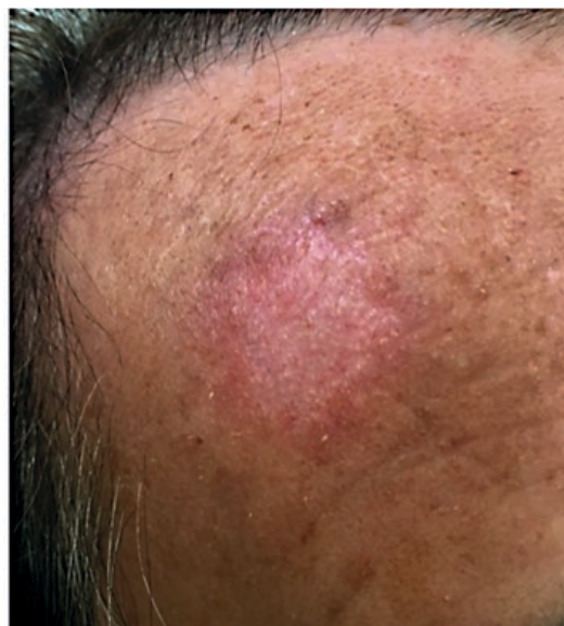
Figure 1 - Annular plaque on the forehead with an atrophic and hypopigmented center and raised erythematous margins.

A 51-year-old caucasian female presented with an 18-month history of an asymptomatic well demarcated annular plaque with central atrophy and raised erythematous margins on her forehead (Fig. 1). The patient had no associated systemic manifestations and denied any preceding local trauma or exposure to previous medication. There was no relevant personal or family history. Laboratory studies were unremarkable. Histopathologic examination showed a granulomatous infiltrate with numerous multinucleated giant cells surrounding solar elastosis (Fig. 2A). Verhoeff-van Gieson stain revealed elastophagocytosis (Fig. 2B). No infectious agents were identified after staining with Ziehl-Neelsen, Grocott and periodic acid-Schiff (PAS).