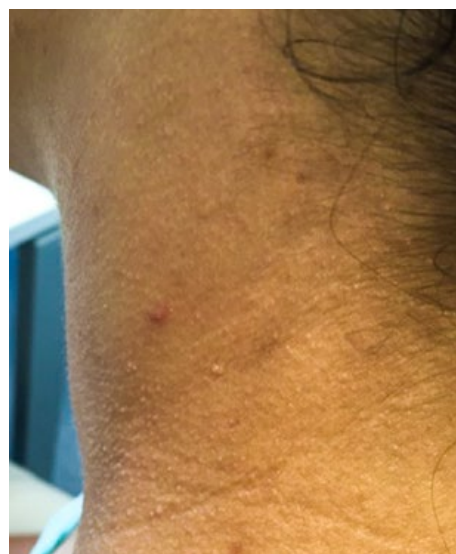
Figure 1 - Multiple discrete skin-colored papules in the neck.

Histopathology from an incisional skin biopsy on the cervical plaque revealed an acanthotic, hyperkeratotic epidermis; transepidermal elimination of numerous, branched, sawtooth-like elastic fibers; a mixed dermal inflammatory infiltrate and some multinucleated giant cells (Fig.s 3-4). These findings suggested a D-penicillamine induced dermatopathy. From the clinicopathological correlation a diagnosis of penicillamine-induced