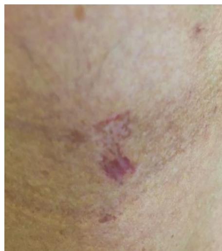
Figure 2 - Atrophic lesion with a poorly defined arciform border and telangiectasia on the right cervical area.

dermatosis consisting of mixed findings of EPS and PPXE was made.