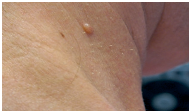
Figure 1 - Right cervical area.

A 47-year-old Caucasian female was evaluated for multiple asymptomatic tiny keratotic papules scattered over the skin of her right chest wall, axilla, neck and supraclavicular areas (Figs. 1 and 2). Lesions were mostly confined to the field of previous adjuvant radiotherapy, after a modified radical mastectomy procedure she endured, five years previously, for an infiltrating ductal carcinoma of the right breast. The patient had neither keratosis pilaris elsewhere nor a personal history of a localized or disseminated inflammatory skin disorder preceding her present condition. The spiny, 0.4-0.5