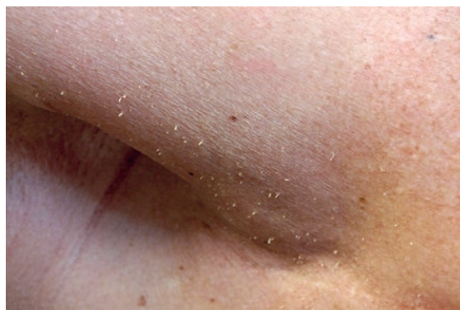
Figure 2 - Right pre-axillary area.

mm diameter spicular papules, were firmly attached to a normal appearing skin and had resisted multiple topical treatments, mostly emollients and mild keratolytic agents. They started to appear 12 months upon completion of the radiotherapy program and had been stable for the last 4 years.