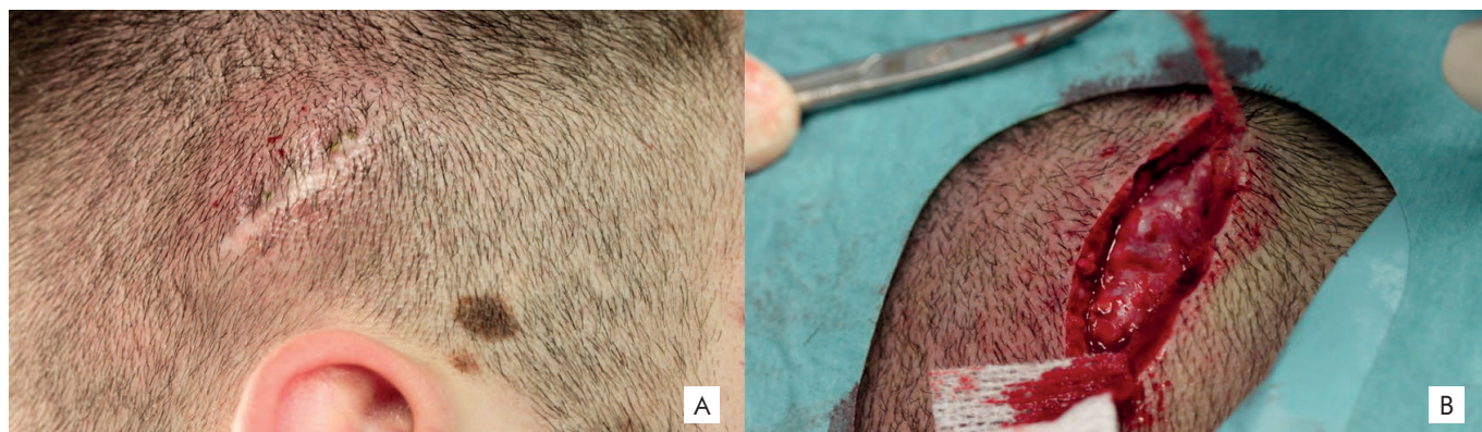
Figure 3 - A) Unnoticed scar of traumatic wound; B) Scar revision using trichophytic technique.