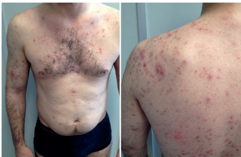
Figure 1 - Papulo-pustular lesions and atrophic scars on the trunk and limbs.

with conventional immunosuppressive therapy represents a need for new drugs. With the discovery of TNF- \alpha as a central inflammatory mediator in BD, anti-TNF agents, mainly infliximab and adalimumab, have been used with promising results concerning efficacy and safety. 6-8