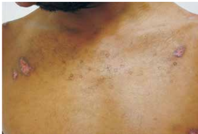
Fig 2 - New ulcerated lesions on chest.

In January 2011, six weeks after the initiation of HAART (zidovudine, lamivudine, and efavirenz), the patient returned referring worsening of the lesions and fever. Physical examination revealed new violaceous and painful nodules and ulcerated lesions, with a clean base and well-defined borders on the right leg (Fig. 1), chest (Fig. 2) and upper limbs. Neither mucocutaneous KS nor symptoms of visceral involvement were present. VDRL and FTA-abs tests for syphilis were negative.