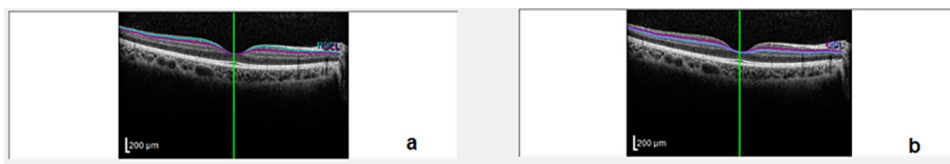
Figure 2. (a) Single horizontal scan of the macula showing a segmented ganglion cell layer and (b) single horizontal scan of the macula showing inner plexiform layer.