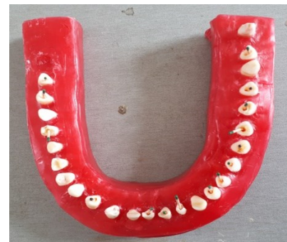
Fig.2 mounting teeth in the U-shaped wax rim.

Radiographic examination: The CBCT scans were obtained using denture scan mode of Newtom 5G System (QR srl, Verona, Italy) set at 110kv and a tube current of 3.46 mA and a mean time of 4.8 seconds with an FOV of 18x16 cm and a voxel size of 0.3 mm. The scans were examined in three planes of axial, coronal and sagittal in multi-planar reformation (MPR) by using NNT viewer software version 3.0 (QR srl, Verona, Italy). The slice thickness was 0.5 mm in this study. Scans were examined by two trained endodontists twice with two-week interval for the presence or absence of a horizontal root fracture (figure 3). The observation was done in a low-light room with the LG Flatron 18.5 inch monitor (LG, Seoul, Korea) and observers were free to choose magnification. In addition, the observers were unaware of how many samples had fracture.