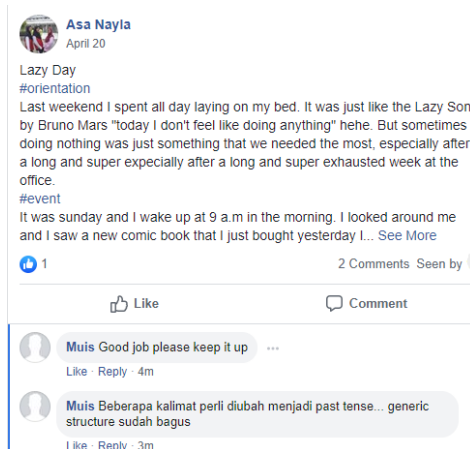
Figure 4. Students' writing result on Group's wall

In this Cycle, the English teacher showed how the implementation of Facebook Closed Group takes places in this research. The teacher had had a Facebook account and were added into the group. In this cycle the teacher took over the group and started giving his students a feedback and motivation to keep them learn more next time. This act can be seen from the figure on the next page.