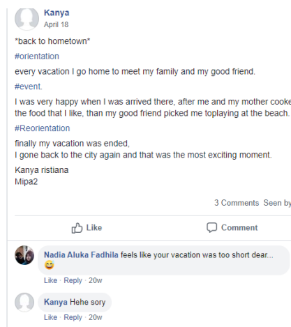
Figure 4.2. The students writing result on groups’ wall

Before the implementation, the important point that researcher need to view in order to prove that this research was succeed happened before the class. That was the action that happened on Wednesday or the deadline day of students that need to submit their work on the group’s wall. It is the important point because this act was the main part of this research. In this part of implementation, the students made and submit their work on the groups’ wall and the researcher gave them some feedback on error that they made or supported them through complement and asks them to work harder next time it can be seen from the figure on below.