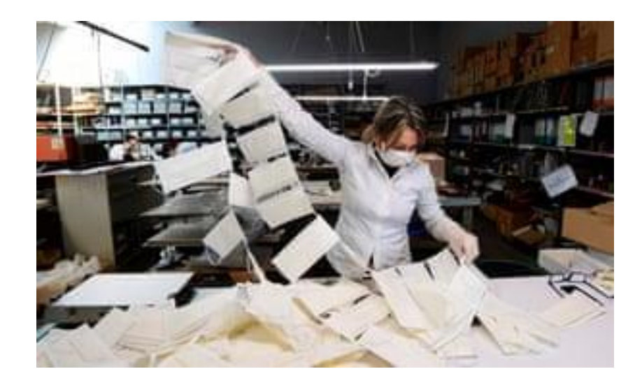
Figure 4: Surgical masks being made at a leather workshop in Italy.

On Wednesday March 18, 2020 Prada started the production of 80,000 medical overalls and 110,000 masks to be allocated to healthcare personnel, following a request from the Tuscany Region (Figure 4). The production plan provides for daily deliveries, which will be completed by April 6th. The articles are being produced internally at the Prada factory in Montone (Perugia-Italy) which has stayed open for this purpose in collaboration with Italian external supplier [6]