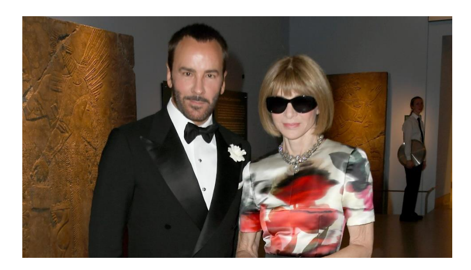
Figure 8: Tom Ford and Anna Wintour.

The CFDA and Vogue Launched 'A Common Thread', a fundraising initiative to support the American fashion community (Figure 8).