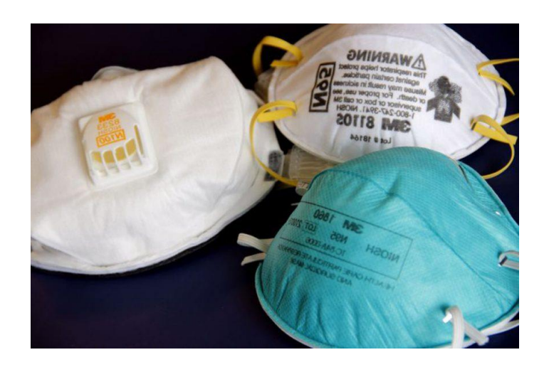
Figure 5: LVMH will be donating FFP2 respirators, like N95 masks, which fit tight around the face and come with or without a valve