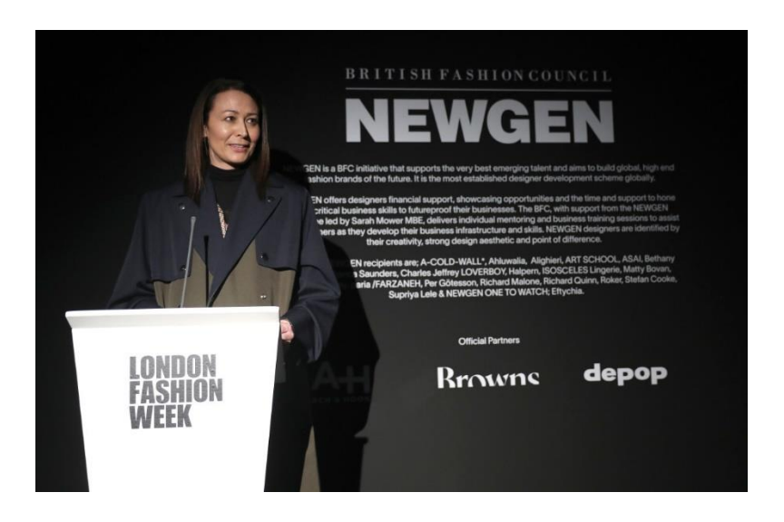
Figure 7: Caroline Rush, Chief Executive of the British Fashion Council, at the opening of London Fashion Week in February 2020.

6. Major Fashion initiatives to support the fight of COVID-19 Crisis