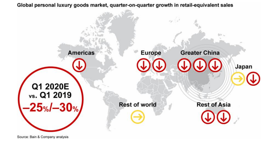
Figure 9: Bain & Company analysis of Luxury market loss 2019/2020

The luxury market in Europe has been stable in the first two-and-a-half months of the year 2020. However, the Italian market has suffered the worst, as quarantines caused double-digit sales declines across the country. Sales rose in general in France, Spain, Germany and the UK, due to tourism from Russia and the Middle East, in addition to stable local demands during the early stages of the outbreak. However, consumer confidence had begun to deteriorate in those territories even before governments put restrictions to stop the virus's spread across the continent. On the contrary, the luxury market in Americas also started to feel the full impact of coronavirus disruption. A decline in Chinese tourist spending did not appear to have had much of an impact in the first two-and-a-half months of the year. But the positive trend that was apparent during the first quarter is already coming under intense pressure as most brands closed their American stores. The movement was negative in the airport network, as the drop in air traffic from Asia was only partly balanced by continued tourism within Europe and America. Discounted sales of luxury goods increased, partially because full-price sales were still dominant in the suffering Asian economies. On the contrary, online sales experienced double-digit growth in Europe and America [20].