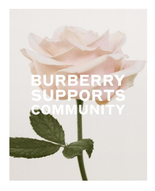
Figure 6: Burberry campaign in fighting COVID-19

Leading luxury brands communicated to customers, employees, and stakeholders with positive and caring messaging in a timely and transparent manner: On February 7, Louis Vuitton posted a heartfelt message to Chinese customers across Little Red Book, WeChat, and Weibo. The message is consistent with the brand image that is positioned as a supplier of fine luggage. Prada communicated with customers about changes of store operations. It notified customers on WeChat about postponed customer service and deliveries. Burberry issued a timely update of the virus's impact to its stakeholders, and the temporary closure of 24 of its 64 stores in mainland China, in addition to reducing operating hours for the rest. Burberry also contributed to the fight against COVID-19 with the soft pink rose advertisement saying: Burberry supports community (Figure 6).