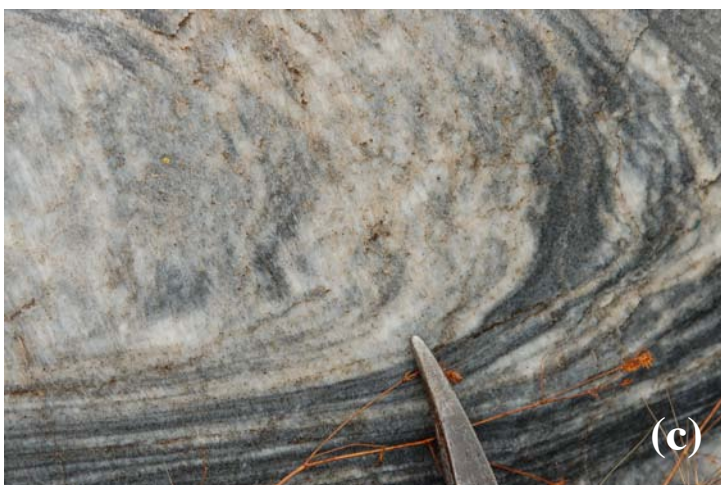
Figure 3. (a) Pseudomorphs (white) after euhedral lawsonite in glaucophane schist from near Grammata in northern Syros. Dark mineral porphyroblasts are coarse-grained rutile. The rock also contains epidote and white mica; (b) Pseudomorphs (white) after euhedral lawsonite in retrograde schist Finikas, southern Syros; (c) Aragonite pseudomorphs (aligned and acicular) showing that aragnite recrystallized after the main fabric forming event. Hammer tip is approximately oriented parallel to the aragonite pseudomorphs. Sample is from near Vissa, southern Syros.