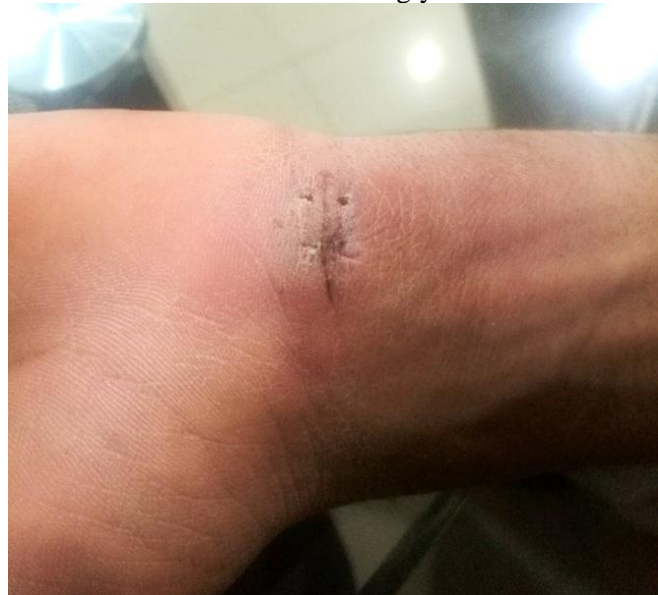
Fig. 1: Transverse 1 cm skin incision for retinaculotomy (printed after obtaining written consent from the patient).

Rest of the part is sort of blind cutting after feel with a scissor tip in backward dragging of the instrument under TCL and then cut accordingly.