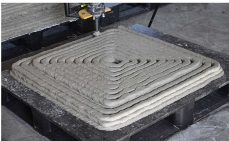
Figure 3. Printing Dragon's Tooth 2.

relocation upon completion. The three dragon's teeth were printed first (Figure 3) to allow them additional time to cure; all three were completed on 6 November. On 7 November, two concrete masonry units and several other custom designs were printed during a half-day print session. That afternoon, the three dragon's teeth and one of the custom designs, the Marines 7th ESB logo, were transported by forklift to a nearby location for a group photo before returning to the printing laboratory to finish curing in a controlled, protected environment. None of the printed surfaces were finished in an effort to highlight the 3D-printed nature and layered appearance of the completed components.