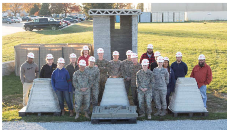
Figure 4. Tri-Service Team with Completed Dragon’s Teeth and 7th ESB Logo.