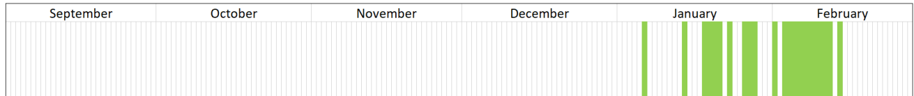
Figure 4. Timing of learning sessions P3. Green bars indicate activities were logged on that day.

gain elective credits while away. However, as she had much less time available for studying while abroad, and there were technical difficulties with the internet connection, she did not complete any of the SPOCs while abroad. After returning home, she completed the SPOC on ‘Food risks’; the other SPOCs were dropped. This was her first experience with studying online. In total, 1012 activities were logged for P3, distributed over 22 days in a time span of two months. Figure 4 shows the timing of the learning sessions.