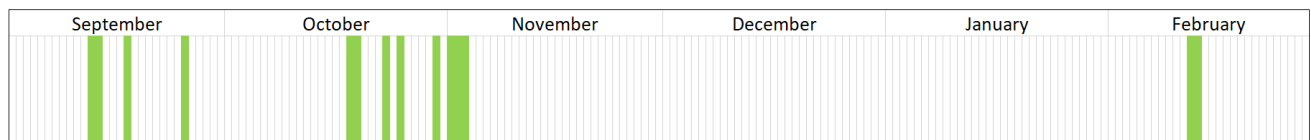
Figure 5. Timing of learning sessions P4. Green bars indicate activities were logged on that day.

P4 followed the course ‘Animal behaviour’, which she finalized with a 8.5. She started the course out of interest in the topic, and only later learned about the opportunity to take an exam and receive elective credits. It was her first experience with studying online. In total, 1296 activities were logged for P4, distributed over 14 days in a time span of 6 months. Figure 5 shows the timing of the learning sessions.