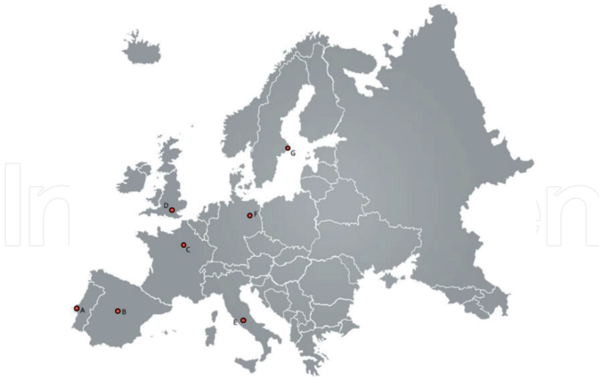
Figure 1. Selected case studies. (A) Lisbon, (B) Madrid, (C) Paris, (D) London, (E) Rome, (F) Berlin, (G) Stockholm.

and 2018 was carried out. Nevertheless, for the cities of London and Stockholm for 1990, there was no data.