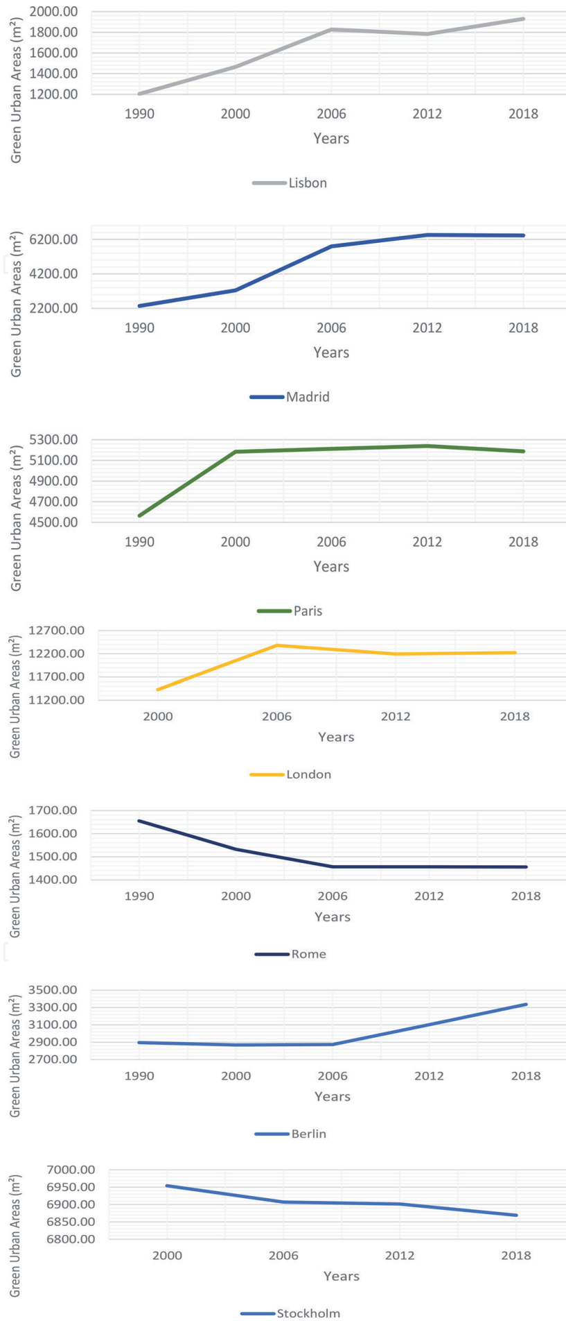
Figure 3. Evolution of the urban green spaces in European major cities (authors).